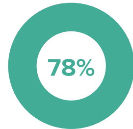
78% increase in point- of-service collections

“Since implementing Clearwave, we’ve seen an incredible return on our investment. Patients have effortlessly adapted to using kiosks. Our rejected claims have dropped by approximately 20%. Our point-of-service collections at the kiosk have increased by roughly 78%. ”